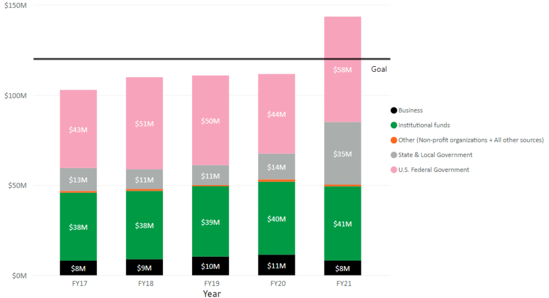
UND R&D by Source of Funds for FY2017 through FY2021