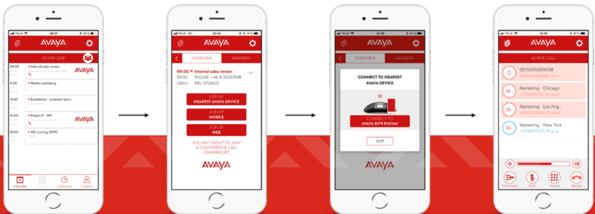
Figure1: Screen Shots showing Calendar, Connection Options, and Conference Controls